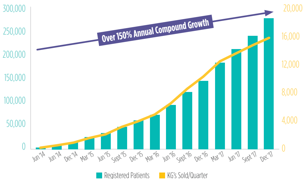
GROWTH IN PATIENTS AND KGS SOLD

Source: Deloitte – Recreational Marijuana, Forbes, Government of Canada