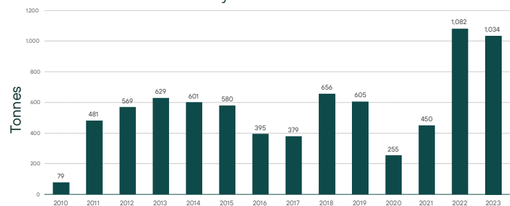
Gold Purchases by Central Banks & Institutions

Gold and other precious metals are one of the oldest assets to act as a store of value, offering a potential hedge against inflation, credit, and currency risks.